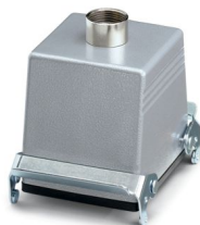
HEAVYCON coupling housing B24, with double locking latch, height 82 mm, with support 1xM25

Please be informed that the data shown in this PDF document is generated from our online catalog. Please find the complete data in the user documentation. Our general terms of use for downloads are valid.