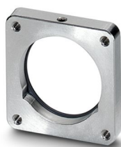
Square mounting flange, Axial seal, 4xM3, flange dimensions: 35 mm x 35 mm, series: RF, Alternative product in accordance with RoHS II without Exemption 6c (Pb < 0.1 %) item no.: 1242369

https://www.phoenixcontact.com/us/products/1607905