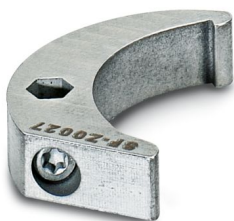
Hook wrench, series: RC, UC, RF, SF

https://www.phoenixcontact.com/us/products/1607455