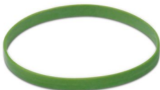
Color coding, color: green

https://www.phoenixcontact.com/us/products/1620588