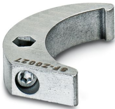
Hook wrench, series: RC, UC, RF, SF

https://www.phoenixcontact.com/us/products/1607455