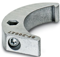
Hook wrench, series: RC, UC, RF, SF

https://www.phoenixcontact.com/us/products/1607455