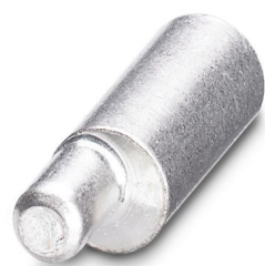
Cable lug for HEAVYCON-MODULAR; PE connection extension to 16 mm 2 , for crimping with crimp pliers

Please be informed that the data shown in this PDF document is generated from our online catalog. Please find the complete data in the user documentation. Our general terms of use for downloads are valid.