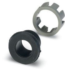
Seal/Collar replacement set Pg9

https://www.phoenixcontact.com/us/products/1640362