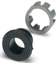
Seal/Collar replacement set Pg9

https://www.phoenixcontact.com/us/products/1640362