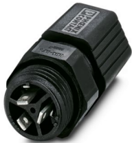
QUICKON panel feed-through, for the front wall assembly with 50 cm long wires, 3-pos.

Please be informed that the data shown in this PDF document is generated from our online catalog. Please find the complete data in the user documentation. Our general terms of use for downloads are valid.