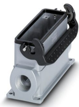
HEAVYCON box mounting base B24, with single locking latch, height 84 mm, with support 1x M40

Please be informed that the data shown in this PDF document is generated from our online catalog. Please find the complete data in the user documentation. Our general terms of use for downloads are valid.