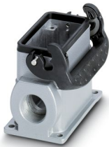
HEAVYCON box mounting base B10, with single locking latch, height 52 mm, with support 1x M20

Please be informed that the data shown in this PDF document is generated from our online catalog. Please find the complete data in the user documentation. Our general terms of use for downloads are valid.