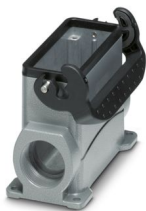
HEAVYCON box mounting base B16, with single locking latch, height 84 mm, with support 1x M32

Please be informed that the data shown in this PDF document is generated from our online catalog. Please find the complete data in the user documentation. Our general terms of use for downloads are valid.