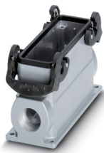
HEAVYCON box mounting base B24, with double locking latch, height 68 mm, with supports 2xM25

Please be informed that the data shown in this PDF document is generated from our online catalog. Please find the complete data in the user documentation. Our general terms of use for downloads are valid.