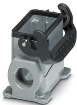
HEAVYCON box mounting base B10, with single locking latch, height 74 mm, with support 1xM25

Please be informed that the data shown in this PDF document is generated from our online catalog. Please find the complete data in the user documentation. Our general terms of use for downloads are valid.