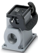
HEAVYCON box mounting base B6, with single locking latch. Height 74 mm, with supports 2x M32

Please be informed that the data shown in this PDF document is generated from our online catalog. Please find the complete data in the user documentation. Our general terms of use for downloads are valid.