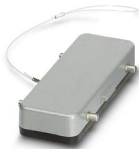
Protective cover B24, for double locking latch, protective cover material: Al, height: 19.6 mm, seal: yes, with lanyard

Please be informed that the data shown in this PDF document is generated from our online catalog. Please find the complete data in the user documentation. Our general terms of use for downloads are valid.