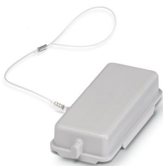
Protective cover B16, for single locking latch, protective cover material: PA, height: 18.5 mm, seal: no, with lanyard

Please be informed that the data shown in this PDF document is generated from our online catalog. Please find the complete data in the user documentation. Our general terms of use for downloads are valid.