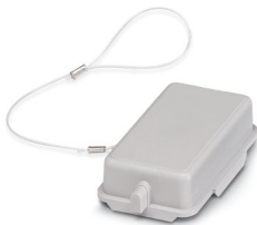
Protective cover B10, for single locking latch, protective cover material: PA, height: 18.5 mm, seal: no, with lanyard

Please be informed that the data shown in this PDF document is generated from our online catalog. Please find the complete data in the user documentation. Our general terms of use for downloads are valid.