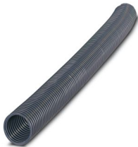
Protective hose, for protective house screw connection, packing volume: 50 m, Pg21

Please be informed that the data shown in this PDF document is generated from our online catalog. Please find the complete data in the user documentation. Our general terms of use for downloads are valid.