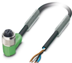
Sensor/actuator cable, 4-position, PUR halogen-free, black-gray RAL 7021, free cable end, on Socket angled M12, coding: A, cable length: 3 m

Please be informed that the data shown in this PDF document is generated from our online catalog. Please find the complete data in the user documentation. Our general terms of use for downloads are valid.