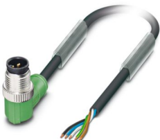
Sensor/actuator cable, 5-position, PUR halogen-free, black-gray RAL 7021, Plug angled M12, coding: A, on free cable end, cable length: 3 m

Please be informed that the data shown in this PDF document is generated from our online catalog. Please find the complete data in the user documentation. Our general terms of use for downloads are valid.