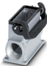
Box mounting base, with single locking latch, height 67 mm, with a support 1x PG21

Please be informed that the data shown in this PDF document is generated from our online catalog. Please find the complete data in the user documentation. Our general terms of use for downloads are valid.