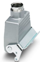
Coupling housing, with single locking latch, height 48 mm, with screw connection, 1x Pg16

Please be informed that the data shown in this PDF document is generated from our online catalog. Please find the complete data in the user documentation. Our general terms of use for downloads are valid.