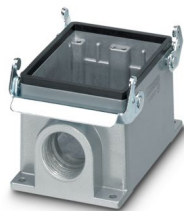
Box mounting base, with double locking latch, height 72 mm, without screw connection, 1x Pg29

Please be informed that the data shown in this PDF document is generated from our online catalog. Please find the complete data in the user documentation. Our general terms of use for downloads are valid.