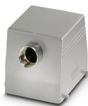
Sleeve housing, for double locking latch, height 80 mm, without screw connection, 1x Pg29, lateral cable entry

Please be informed that the data shown in this PDF document is generated from our online catalog. Please find the complete data in the user documentation. Our general terms of use for downloads are valid.