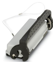
Protective cover B24, with single locking latch, protective cover material: PA, height: 21.6 mm, seal: yes, with lanyard

Please be informed that the data shown in this PDF document is generated from our online catalog. Please find the complete data in the user documentation. Our general terms of use for downloads are valid.