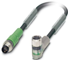
Sensor/actuator cable, 3-position, PUR halogen-free, black-gray RAL 7021, Plug straight M8, coding: A, with 2 LEDs, on Socket angled M8, with 2 LEDs, cable length: 1.5 m

Please be informed that the data shown in this PDF document is generated from our online catalog. Please find the complete data in the user documentation. Our general terms of use for downloads are valid.