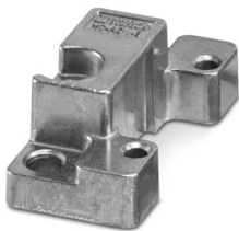
Panel-mount flange for HEAVYCON ADVANCE housing

Please be informed that the data shown in this PDF document is generated from our online catalog. Please find the complete data in the user documentation. Our general terms of use for downloads are valid.