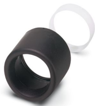
Seal, outside, to increase the protection type, size Pg21

Please be informed that the data shown in this PDF document is generated from our online catalog. Please find the complete data in the user documentation. Our general terms of use for downloads are valid.