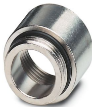
NPT adapter, IP68, up to 5 bar, incl. O-ring seal, M20 to 1/2"

Please be informed that the data shown in this PDF document is generated from our online catalog. Please find the complete data in the user documentation. Our general terms of use for downloads are valid.