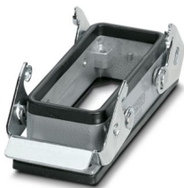
HEAVYCON panel mounting base B24, with double locking latch made of sheet steel, height 27 mm, with flat gasket

Please be informed that the data shown in this PDF document is generated from our online catalog. Please find the complete data in the user documentation. Our general terms of use for downloads are valid.