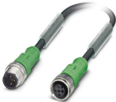
Sensor/actuator cable, 3-position, PUR halogen-free, black-gray RAL 7021, Plug straight M12, coding: A, on Socket straight M12, coding: A, cable length: 10 m

Please be informed that the data shown in this PDF document is generated from our online catalog. Please find the complete data in the user documentation. Our general terms of use for downloads are valid.