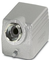
Sleeve housing, for single locking latch, height 43 mm, with screw connection, 1x Pg13.5, lateral cable entry

Please be informed that the data shown in this PDF document is generated from our online catalog. Please find the complete data in the user documentation. Our general terms of use for downloads are valid.