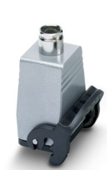
Coupling housing, with single locking latch, height 73 mm, with screw connection, 1x Pg13.5

Please be informed that the data shown in this PDF document is generated from our online catalog. Please find the complete data in the user documentation. Our general terms of use for downloads are valid.