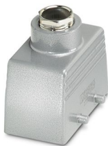
Sleeve housing, for double locking latch, height 45 mm, with screw connection, 1x Pg16, straight cable entry

Please be informed that the data shown in this PDF document is generated from our online catalog. Please find the complete data in the user documentation. Our general terms of use for downloads are valid.