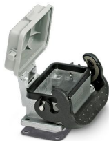
HEAVYCON B10 panel mounting base, with single locking latch, height: 29 mm, with plastic cover, with flat gasket

Please be informed that the data shown in this PDF document is generated from our online catalog. Please find the complete data in the user documentation. Our general terms of use for downloads are valid.