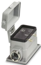
Box mounting base, for double locking latch, height 52 mm, with screw connection, 1x Pg16, with protective covers

Please be informed that the data shown in this PDF document is generated from our online catalog. Please find the complete data in the user documentation. Our general terms of use for downloads are valid.