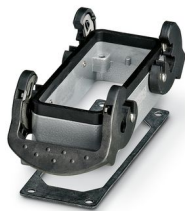
HEAVYCON B16 panel mounting base, with double locking latch, height: 29 mm, with flat gasket

Please be informed that the data shown in this PDF document is generated from our online catalog. Please find the complete data in the user documentation. Our general terms of use for downloads are valid.