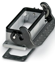
HEAVYCON B16 panel mounting base, with single locking latch, height: 29 mm, with flat gasket

Please be informed that the data shown in this PDF document is generated from our online catalog. Please find the complete data in the user documentation. Our general terms of use for downloads are valid.