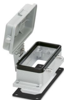
HEAVYCON B16 panel mounting base, for double locking latch, height: 29 mm, with plastic cover, with flat gasket

Please be informed that the data shown in this PDF document is generated from our online catalog. Please find the complete data in the user documentation. Our general terms of use for downloads are valid.