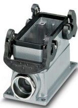
Box mounting base, with double locking latch, height 67 mm, with screw connection, 2x Pg21

Please be informed that the data shown in this PDF document is generated from our online catalog. Please find the complete data in the user documentation. Our general terms of use for downloads are valid.