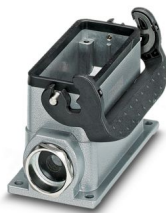
Box mounting base, with single locking latch, height 67 mm, with screw connection, 1x Pg21

Please be informed that the data shown in this PDF document is generated from our online catalog. Please find the complete data in the user documentation. Our general terms of use for downloads are valid.