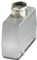
Sleeve housing, for double locking latch, height 76 mm, with screw connection, 1x Pg29, straight cable entry

Please be informed that the data shown in this PDF document is generated from our online catalog. Please find the complete data in the user documentation. Our general terms of use for downloads are valid.