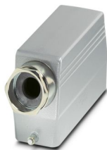
Sleeve housing, for single locking latch, height 76 mm, with screw connection, 1x Pg21, lateral cable entry

Please be informed that the data shown in this PDF document is generated from our online catalog. Please find the complete data in the user documentation. Our general terms of use for downloads are valid.