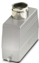
Sleeve housing, for single locking latch, height 76 mm, with screw connection, 1x Pg21, straight cable entry

Please be informed that the data shown in this PDF document is generated from our online catalog. Please find the complete data in the user documentation. Our general terms of use for downloads are valid.