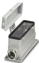
Box mounting base, for double locking latch, height 67 mm, with screw connection, 2x Pg21, with protective covers

Please be informed that the data shown in this PDF document is generated from our online catalog. Please find the complete data in the user documentation. Our general terms of use for downloads are valid.