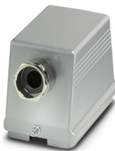
Sleeve housing, for single locking latch, height 96 mm, with screw connection, 1x Pg29, lateral cable entry

Please be informed that the data shown in this PDF document is generated from our online catalog. Please find the complete data in the user documentation. Our general terms of use for downloads are valid.