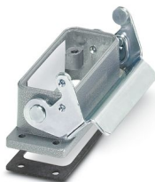
HEAVYCON panel mounting base D15, with single locking latch, height 26 mm

Please be informed that the data shown in this PDF document is generated from our online catalog. Please find the complete data in the user documentation. Our general terms of use for downloads are valid.