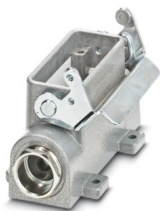
Box mounting base, with single locking latch, height 52 mm, with screw connection, 1x Pg16

Please be informed that the data shown in this PDF document is generated from our online catalog. Please find the complete data in the user documentation. Our general terms of use for downloads are valid.