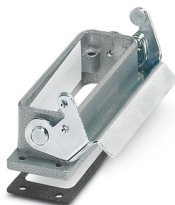
HEAVYCON panel mounting base D25, with single locking latch, height 26 mm

Please be informed that the data shown in this PDF document is generated from our online catalog. Please find the complete data in the user documentation. Our general terms of use for downloads are valid.