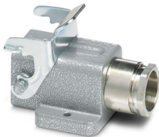
HEAVYCON D7 box mounting base, with single locking latch, height 25.5 mm, with 1 x Pg11 screw connection, with open bottom, zinc

Please be informed that the data shown in this PDF document is generated from our online catalog. Please find the complete data in the user documentation. Our general terms of use for downloads are valid.