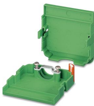
Cable housing, color: green, product range: KGG-MC 1,5, width: 14.5 mm

Please be informed that the data shown in this PDF document is generated from our online catalog. Please find the complete data in the user documentation. Our general terms of use for downloads are valid.